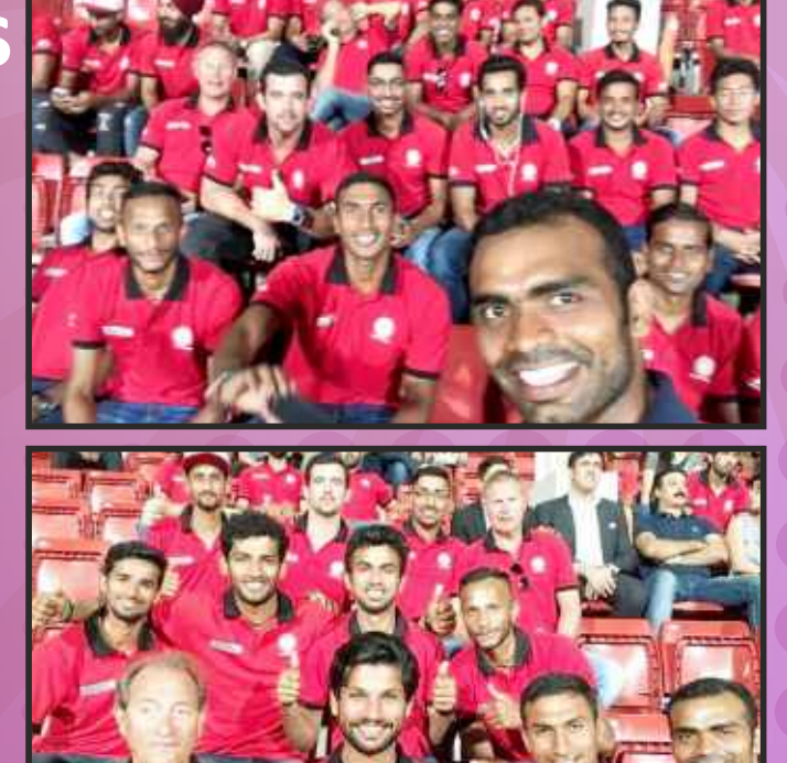
India's hockey stars are out in full support for the Indian Cricket Team in their WT20 clash versus Bangladesh