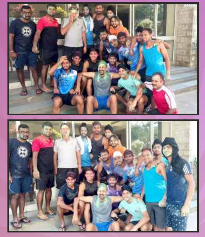
Amongst all the preparations for the crucial hockey season coming up, the Indian Senior & Junior Men's Teams took some time to cool off by celebrating the festival of Holi