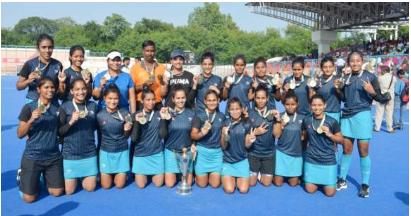
Gold Medalist - Hockey Madhya Pradesh