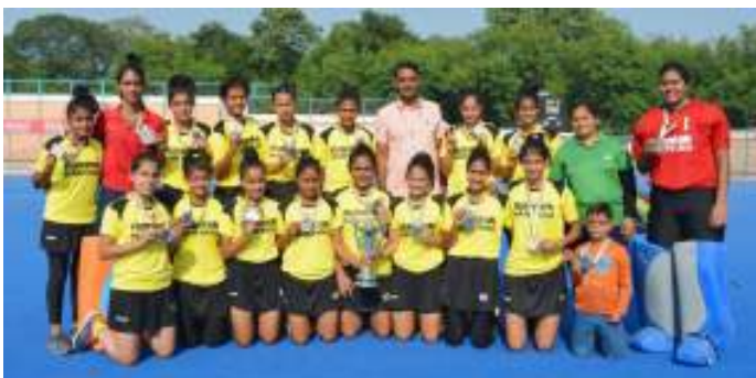
Silver Medalist - Hockey Haryana