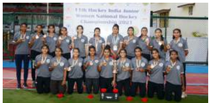
Bronze Medalist - Hockey Maharashtra