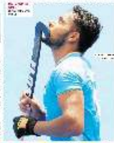
Portrait of a hockey player.

INDIAN HOCKEY ON A HIGH! Indian hockey is on a high after a successful performance in a recent tournament. The team's victory has boosted the morale of the players and fans alike. The team's performance was exceptional, with several key players contributing to the win. The victory is a testament to the hard work and dedication of the players and the coaching staff.