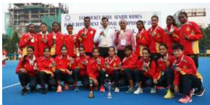
Bronze Medalist - Sashastra Seema Bal