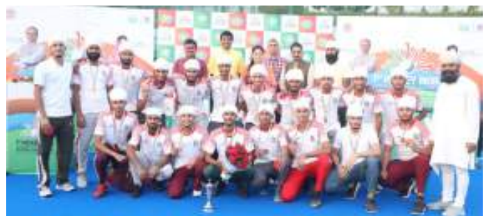
Bronze Medalist - Namdhari XI