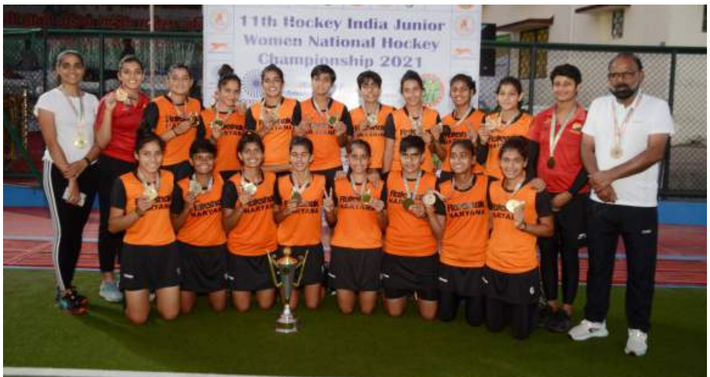
Gold Medalist - Hockey Haryana