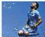
Action shot of a hockey player in a blue jersey.

How India won a historic Olympic bronze in hockey in Tokyo The Indian national hockey team secured a historic bronze medal at the Tokyo Olympics. The victory was a significant achievement for the team and the country. The team's performance was exceptional, with several key players contributing to the win. The victory is a testament to the hard work and dedication of the players and the coaching staff.