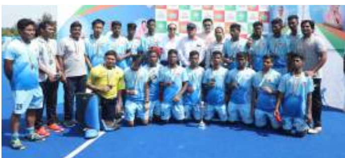
Silver Medalist - Odisha Naval Tata High Performance Centre