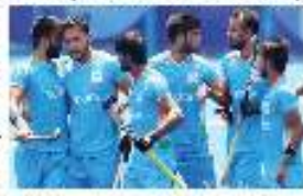
Group photo of hockey players in blue jerseys.

30 members for hockey's senior national camp The Hockey Federation of India (HFI) has announced the selection of 30 players for the senior national camp. The camp is scheduled to start in the coming days and will be held at a premier sports facility. The selected players will undergo intensive training and conditioning under the guidance of the national coaching staff. The camp is expected to be a crucial period for the players to prepare for the upcoming international tournaments.