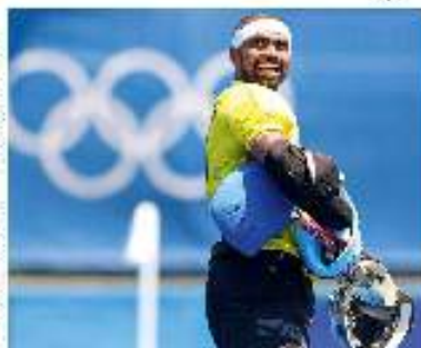
Action shot of a hockey player in a yellow jersey.