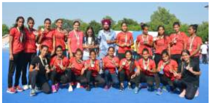
Bronze Medalist - Hockey Punjab