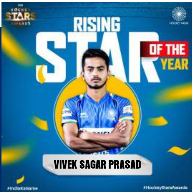
Congratulations to Vivek Sagar Prasad for bagging the 'FIH Rising Star of the Year Men's