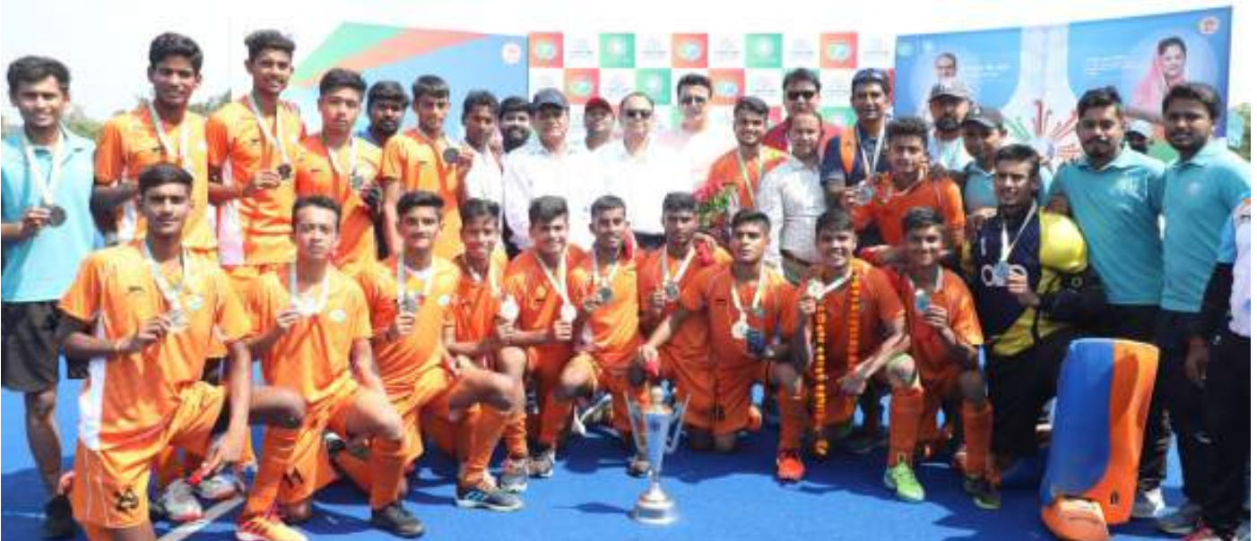
Gold Medalist - Madhya Pradesh Hockey Academy