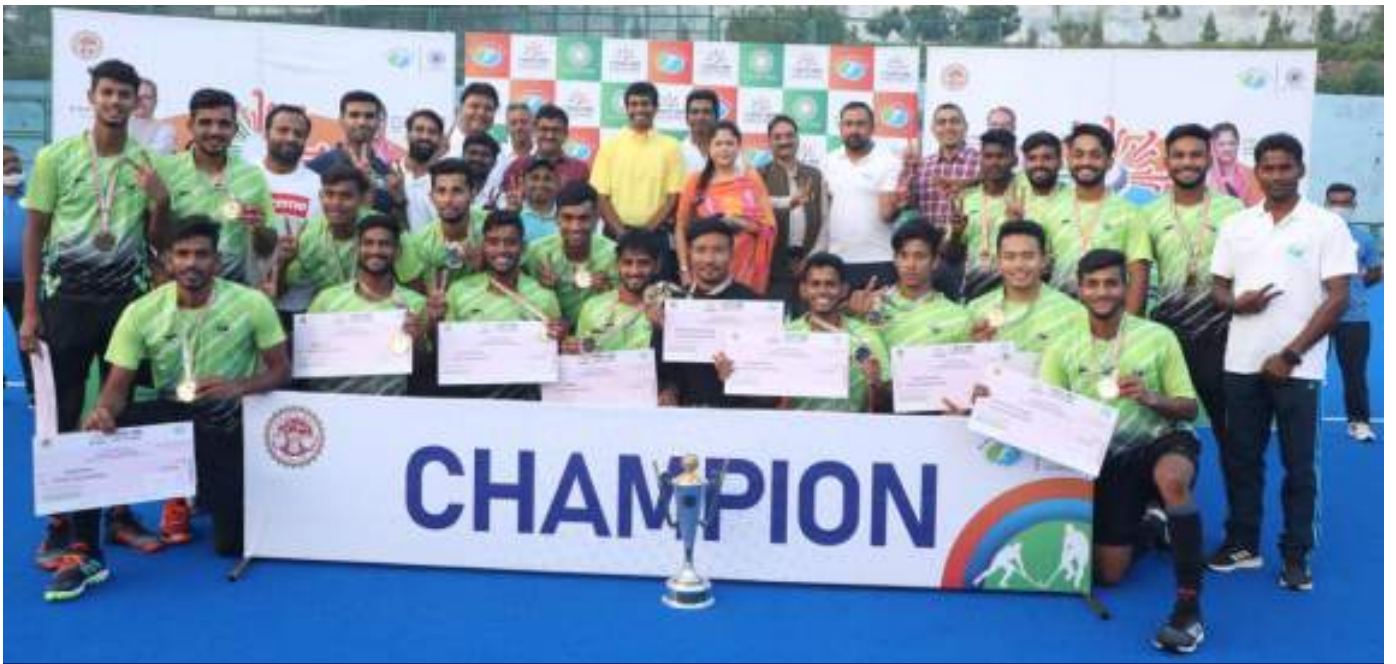
Gold Medalist - Madhya Pradesh Hockey Academy