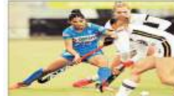
India women's hockey team captain Udita Singh (left) celebrates with teammates after scoring a goal during the match against Australia at the Tokyo Olympics. The team's victory was a historic moment for Indian women's hockey.

Udita, who was an integral part of the Indian women's hockey team that finished fourth at the Tokyo Olympics 2021, expressed her joy by saying the greatest moment for her was when she scored a goal in the final phase of the match. She said she was always aware of playing against top teams at international events like Olympics and ranking the Olympics as the greatest moment of her career.