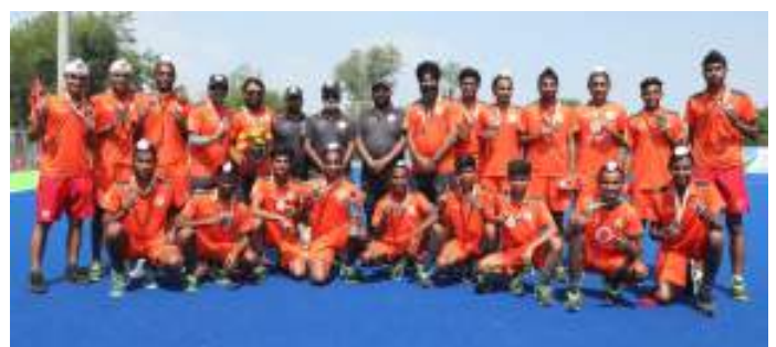
Bronze Medalist - Round Glass Punjab Hockey Club Academy