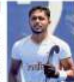
Coach Graham Reid.

PRATHI TRUST OF INDIA, GENEVA: India swept the International Hockey Federation's annual awards on Wednesday, claiming all the top honours based on a voting system which was lambasted as a "bribe" by men's Olympic champion Belgium, prompting the FIH to say that it would try to figure why some associations did not cast their ballot.