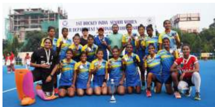
Silver Medalist - Sports Authority of India