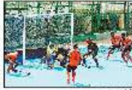
Naval School, Central Board, Sardar Sarabji College, IIP Hockey Academy to win; Vaidpati Raja Hockey today

Naval School, Central Board, Sardar Sarabji College, IIP Hockey Academy to win; Vaidpati Raja Hockey today Naval School, Central Board, Sardar Sarabji College, IIP Hockey Academy to win; Vaidpati Raja Hockey today Naval School, Central Board, Sardar Sarabji College, IIP Hockey Academy to win; Vaidpati Raja Hockey today