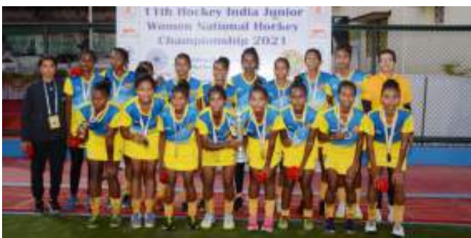
Silver Medalist - Hockey Jharkhand