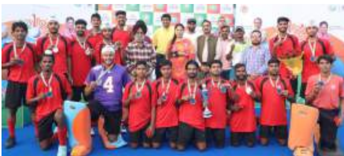
Silver Medalist - Raja Karan Hockey Academy