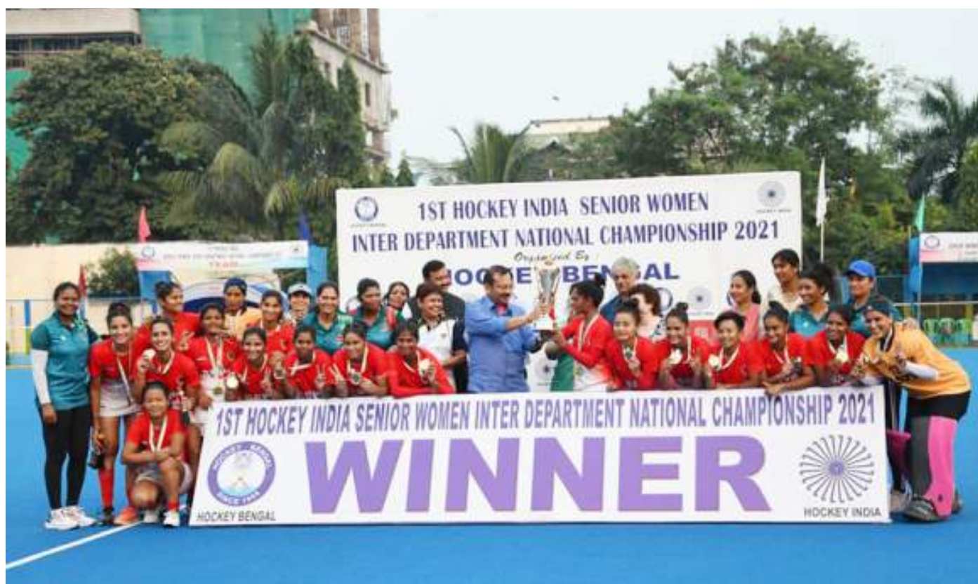
Gold Medalist - Railway Sports Promotion Board