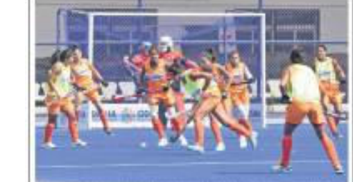
Indian women's hockey team players warm up during their practice session at the Bhubaneswar stadium in Bhubaneswar, Odisha.