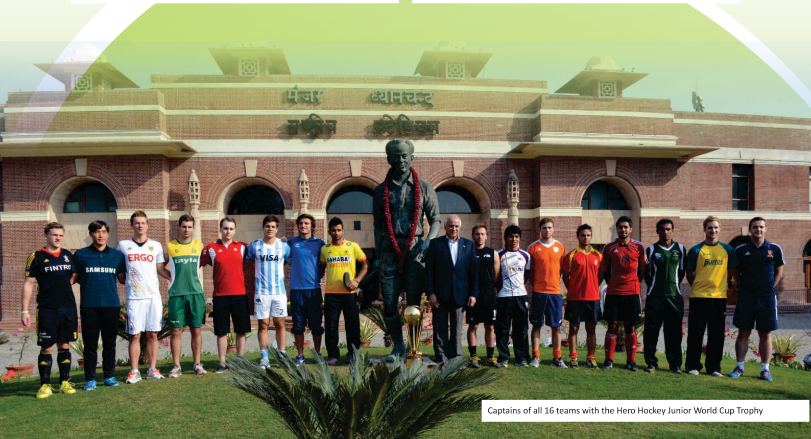
Captains of all 16 teams with the Hero Hockey Junior World Cup Trophy