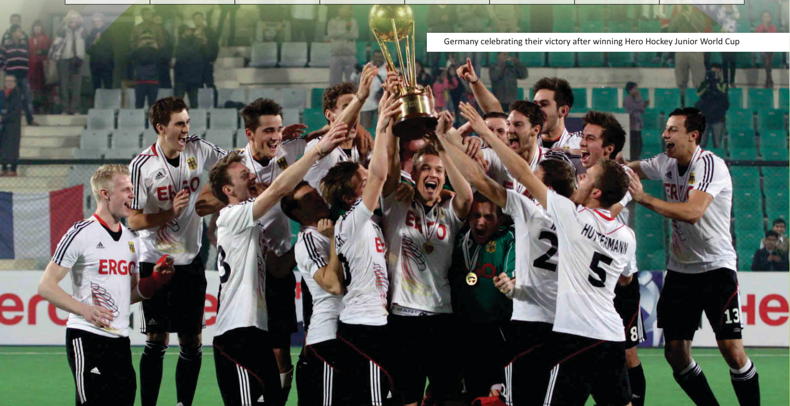
Germany celebrating their victory after winning Hero Hockey Junior World Cup