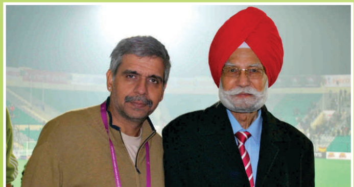
Mr. Sandeep Dikshit, Member Parliament Lok Sabha with Olympian Mr. Balbir Singh Senior