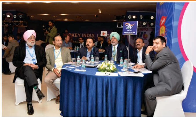
Delhi Waveriders team management during the HHIL Closed Bid