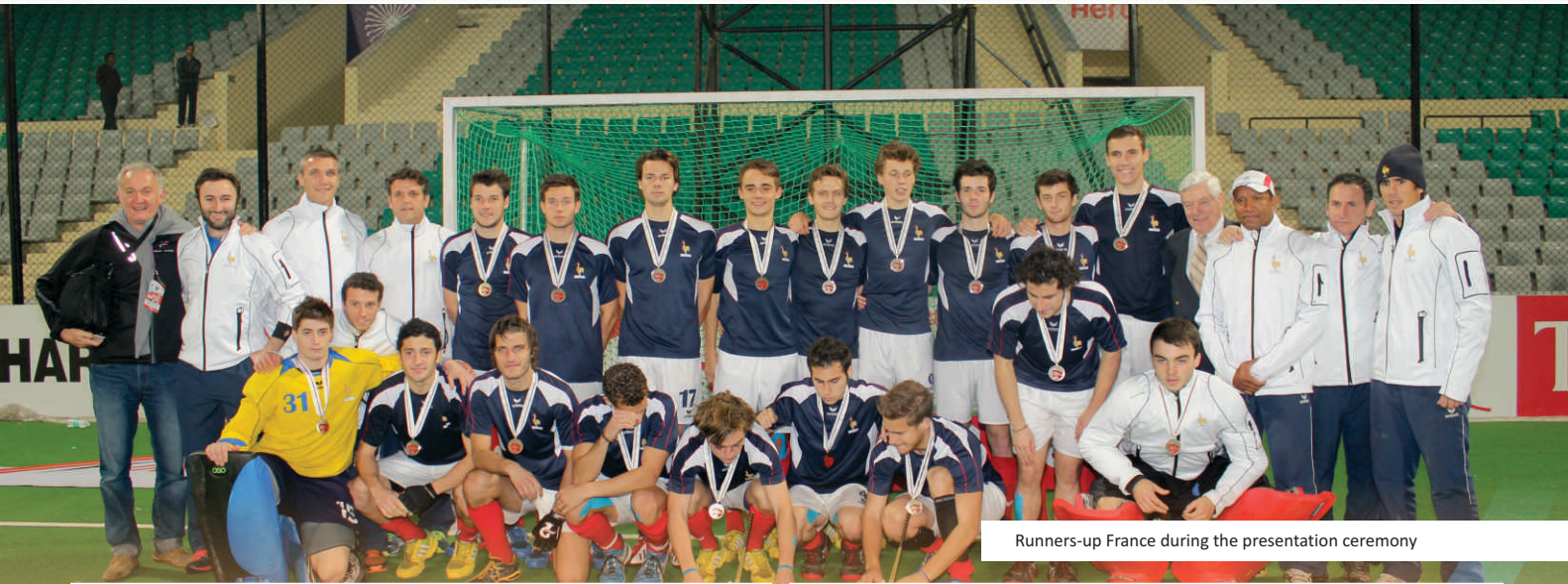
Runners-up France during the presentation ceremony