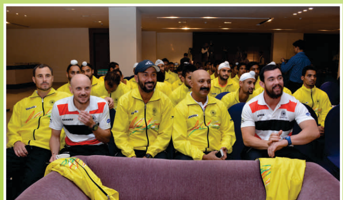
Players and Support Staff of Indian Junior Men Hockey Team during team announcement event.