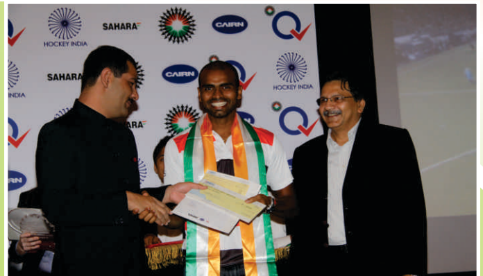
Mr. Jitendra Singh, Minister of State for Youth Affairs and Sports (Independent Charge) presenting a cheque of Rupees One Lakh to PR Sreejesh for winning Goalkeeper of the Tournament in Asia Cup.