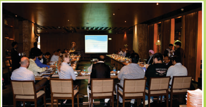
HHIL Franchise Workshop in progress