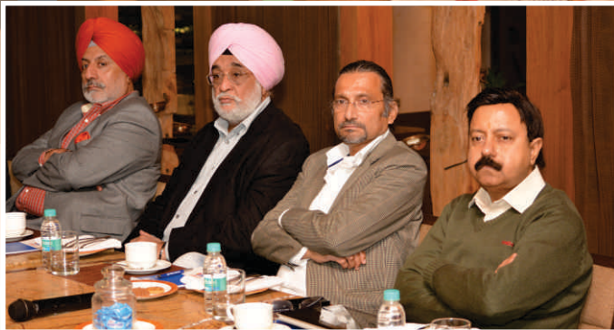
Delhi Waveriders team management during the HHIL Franchise Workshop