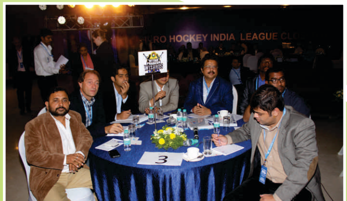
Uttar Pradesh Wizards team management during the HHIL Closed Bid