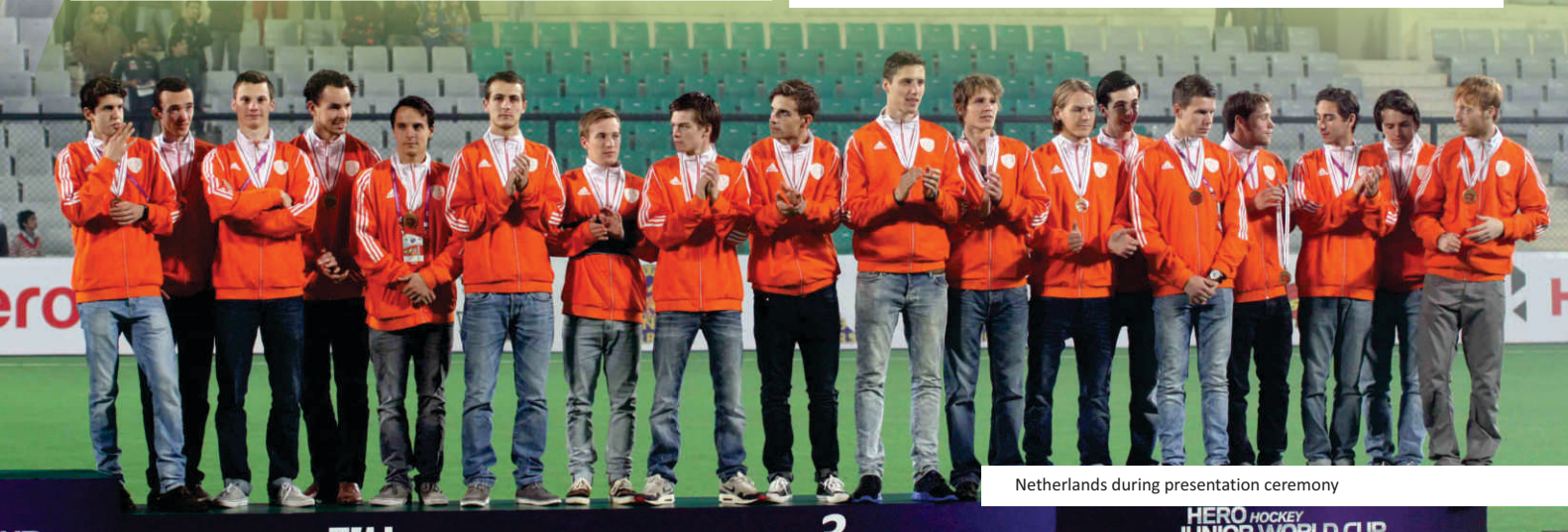
Netherlands during presentation ceremony