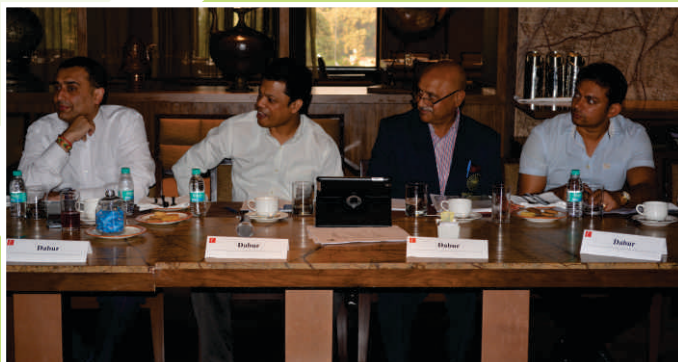
Dabur Mumbai Magicians team management during the HHIL Franchise Workshop