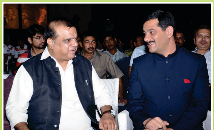
Dr. Narinder Batra, Secretary General Hockey India in discussion with Mr. Jitendra Singh, Minister of State for Youth Affairs and Sports (Independent Charge)