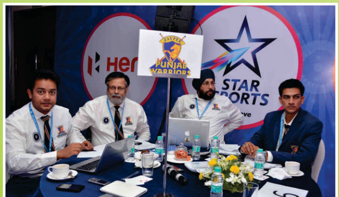
Jaypee Punjab Warriors team management during the HHIL Closed Bid