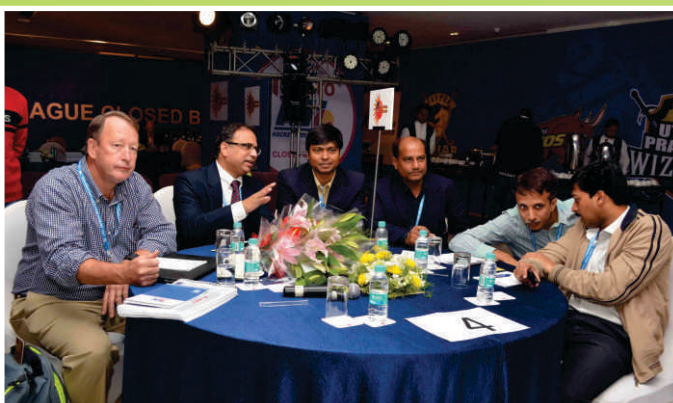
Kalinga Lancers team management during the HHIL Closed Bid