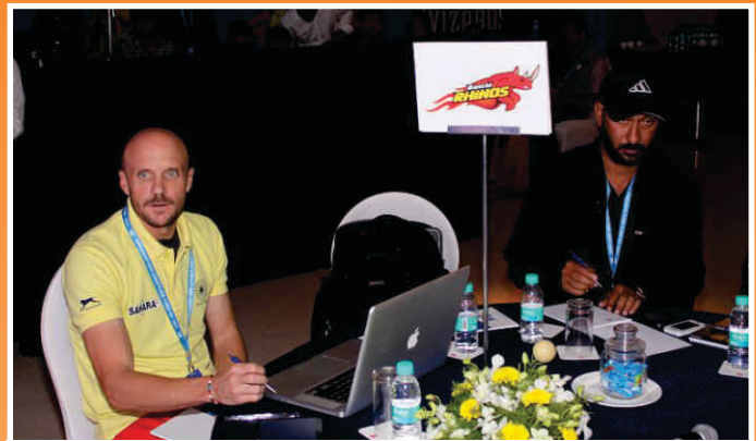
Ranchi Rhinos team management during the HHIL Closed Bid