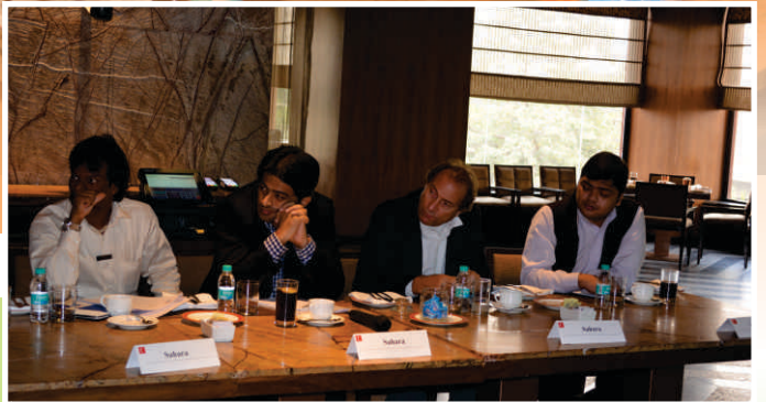
Uttar Pradesh Wizards team management during the HHIL Franchise Workshop