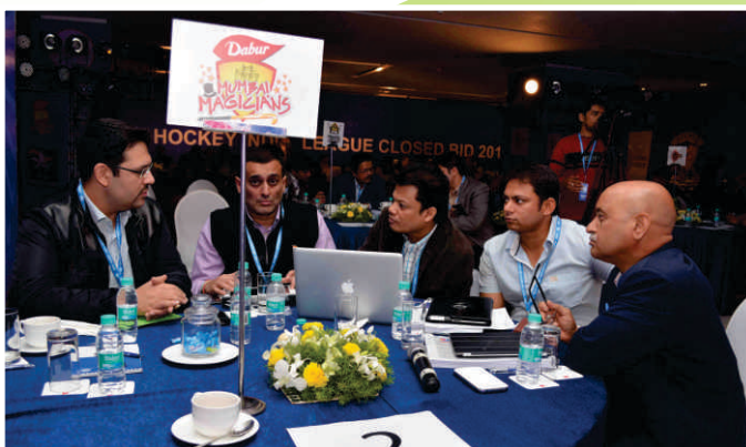
Dabur Mumbai Magicians team management during the HHIL Closed Bid