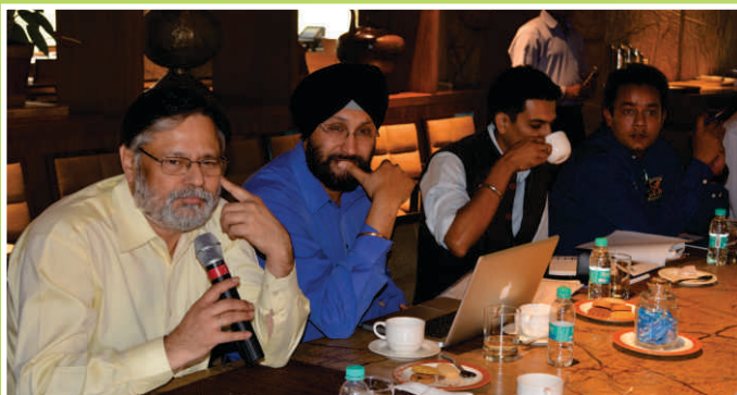
Japjee Punjab Warriors team management during the HHIL Franchise Workshop