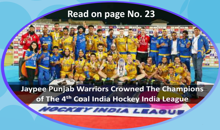
Jaypee Punjab Warriors Crowned The Champions of The 4 th Coal India Hockey India League