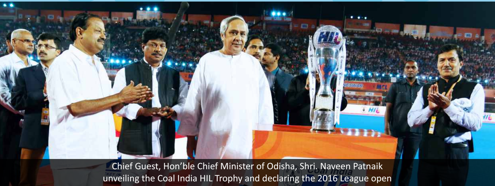
Chief Guest, Hon'ble Chief Minister of Odisha, Shri. Naveen Patnaik unveiling the Coal India HIL Trophy and declaring the 2016 League open