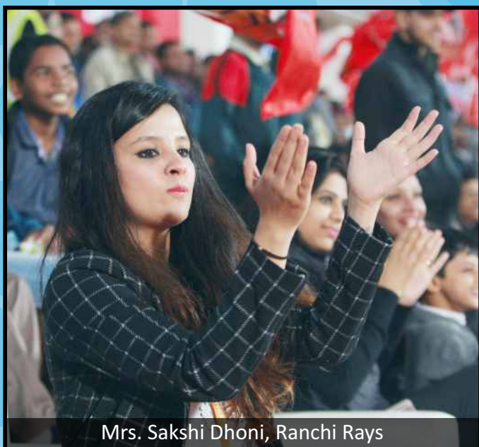
Mrs. Sakshi Dhoni, Ranchi Rays